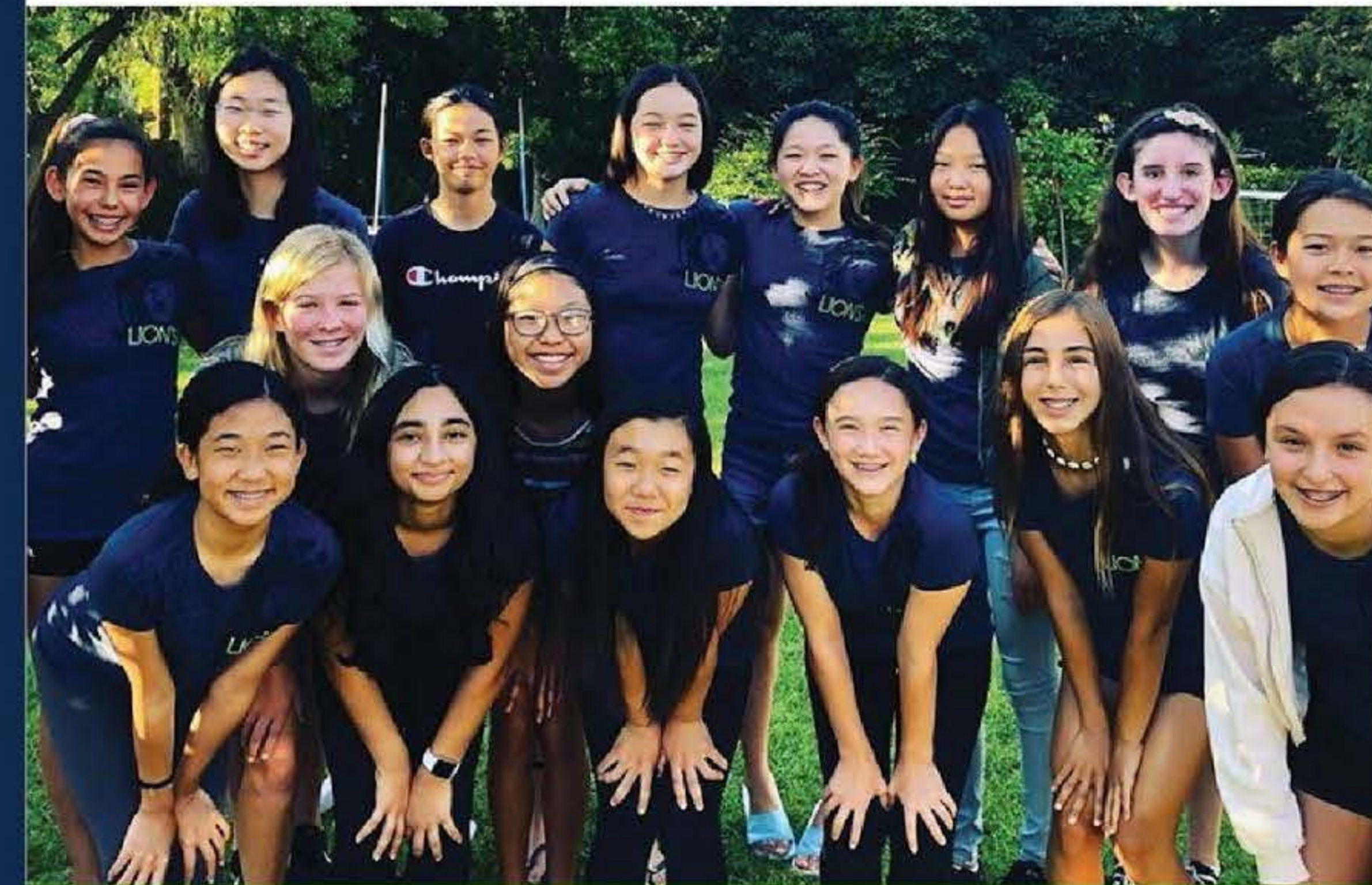
Fullerton, CA, 2024 girls blue group excited for a great year!

For Partnership/Sponsorship information please contact us at 800.894.8877 .