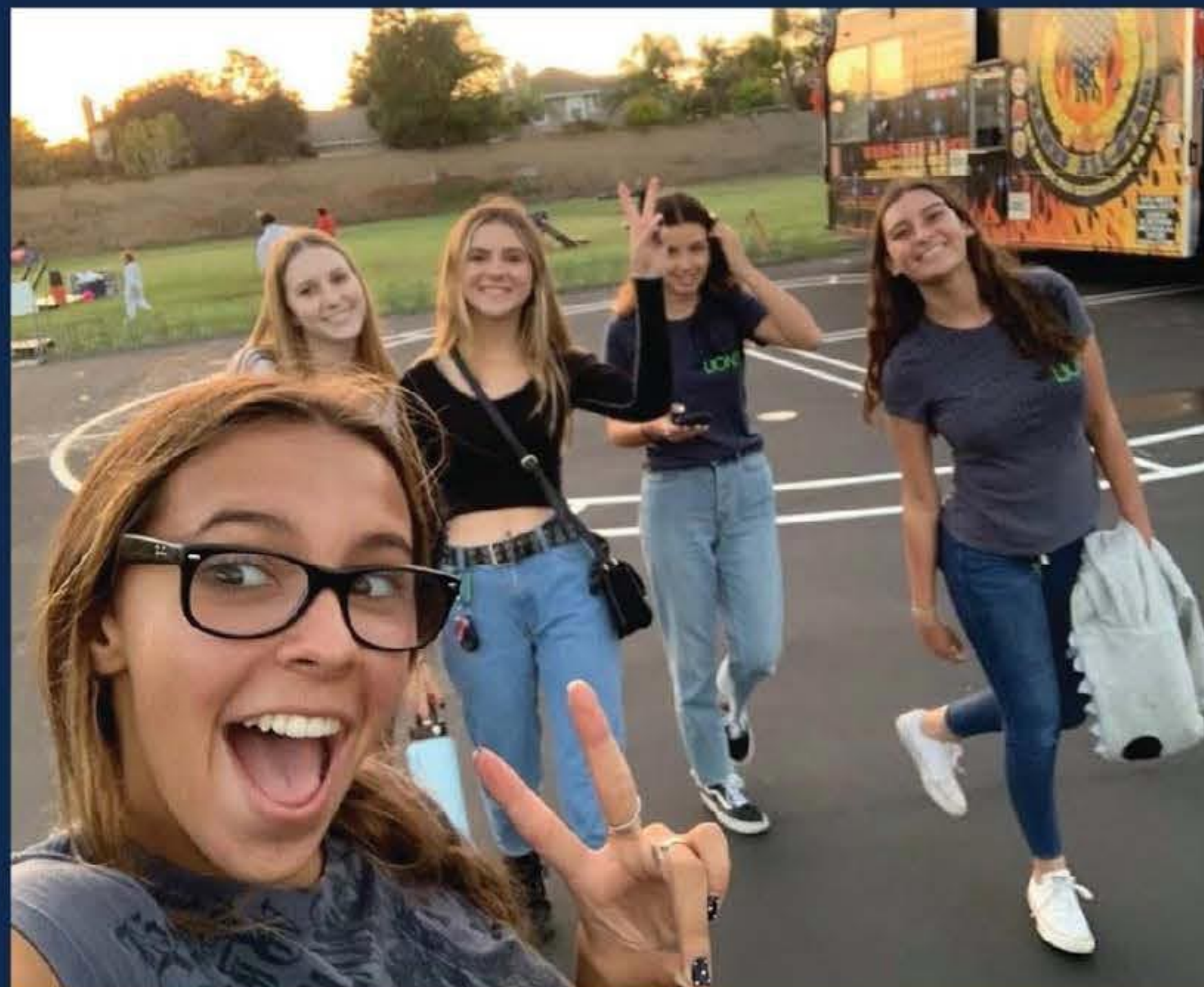
Huntington Beach, CA, 2021 girls blue group had a blast volunteering at the SeaCliff Elementary Harvest Festival